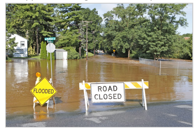
Cocalico Street, Ephrata, PA, 09/12/18

Disaster Recovery efforts for a community in good standing and for their