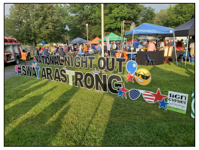
Swatara Township, Dauphin County.

Thanks to all who took advantage of this initiative. Please take time to visit a NNO event near you and support your local police.