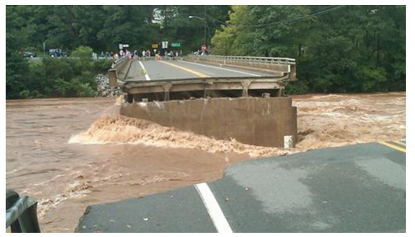
PA 973 bridge washed out near Loyalsockville, PA, September 2011.

threats to life and property in the United Marginal to Slight, Moderate and High. The States, and Pennsylvania has a long history of ERO risk probabilities and corresponding significant floods. The deadliest flood in U.S. categories apply to areas about the size of a history occurred in Johnstown, Pennsylvania medium-sized city (within 25 miles of any in 1889 from a dam failure as the result of point). One way to think about the risk of heavy rainfall. Since 2000, Pennsylvania had flash flooding at this spatial scale is to roughly 44 flood-related fatalities and over $1.5 billion equate the probability or category description in flood damage according to Weather Service statistics. The majority of either your county or a medium-sized city. those deaths were due to flash flooding. Rapid onset flooding coincident with, or in the hours immediately following heavy rainfall. Therefore, monitoring the potential for heavy flooding becomes more widespread, and rain and flash flooding is of critical importance significant flash flooding is more likely. WPC for decision makers and those charged with the protection of life and property.