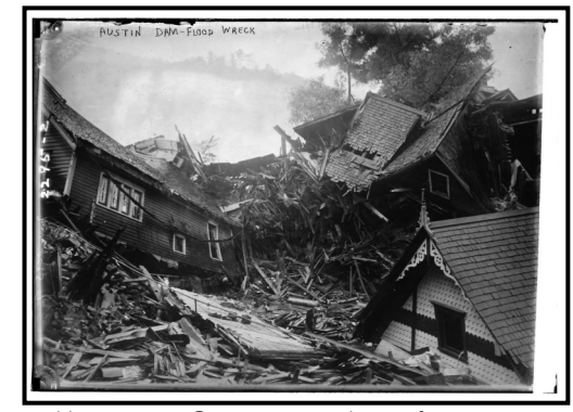
Building Damage

Like all paper mills, the Bayless mill needed a continual supply of water to operate. After facing several water shortages, the company decided to construct a large concrete dam on Freeman Run in 1909. Although designed by a professional engineer, the company made cost-cutting modifications to the dam that contributed to a minor structural failure in January 1910. Repairs were made, but the events of the following year proved that the dam remained unsound.