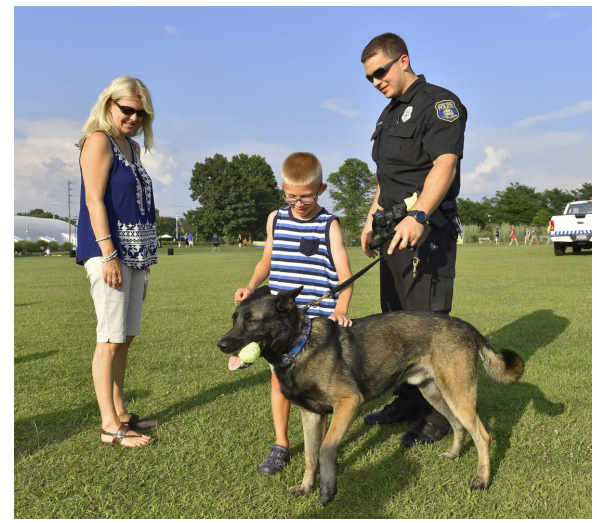
Manheim Township, Lancaster County.