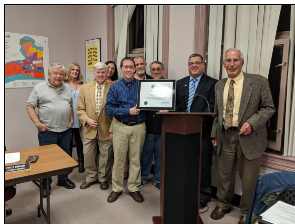
Bloomsburg Town Counsel receives recognition on October 28, 2019