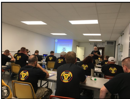
PA Department of Corrections receives G-320 Class

D2019-5 replaces D2014-1 which lays out the requirements for radiological responders to achieve certification and establishes an expectation for counties to have and maintain at least a limited capacity for response. This revision clears up some of the areas of misinterpretation and attempts to simplify the previous directive.