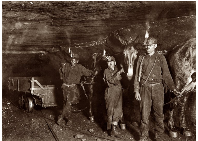
Coal Miners

Tyrone Daily Herald Pennsylvania 1905-11-16